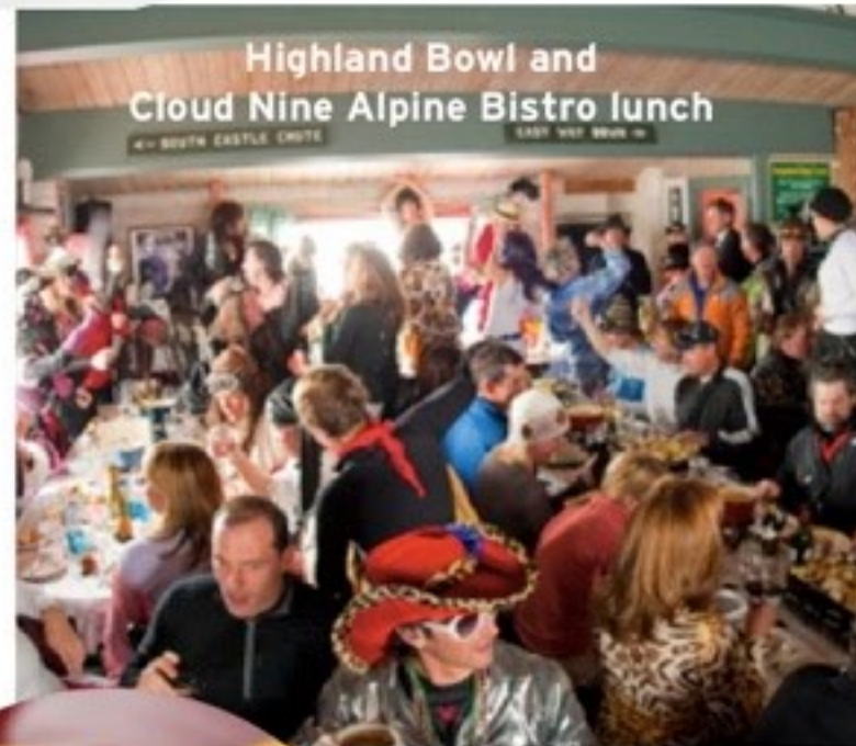
Highland Bowl and Cloud Nine Alpine Bistro lunch