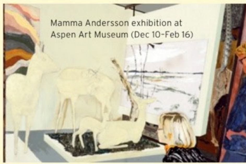
Mamma Andersson exhibition at Aspen Art Museum (Dec 10-Feb 16)