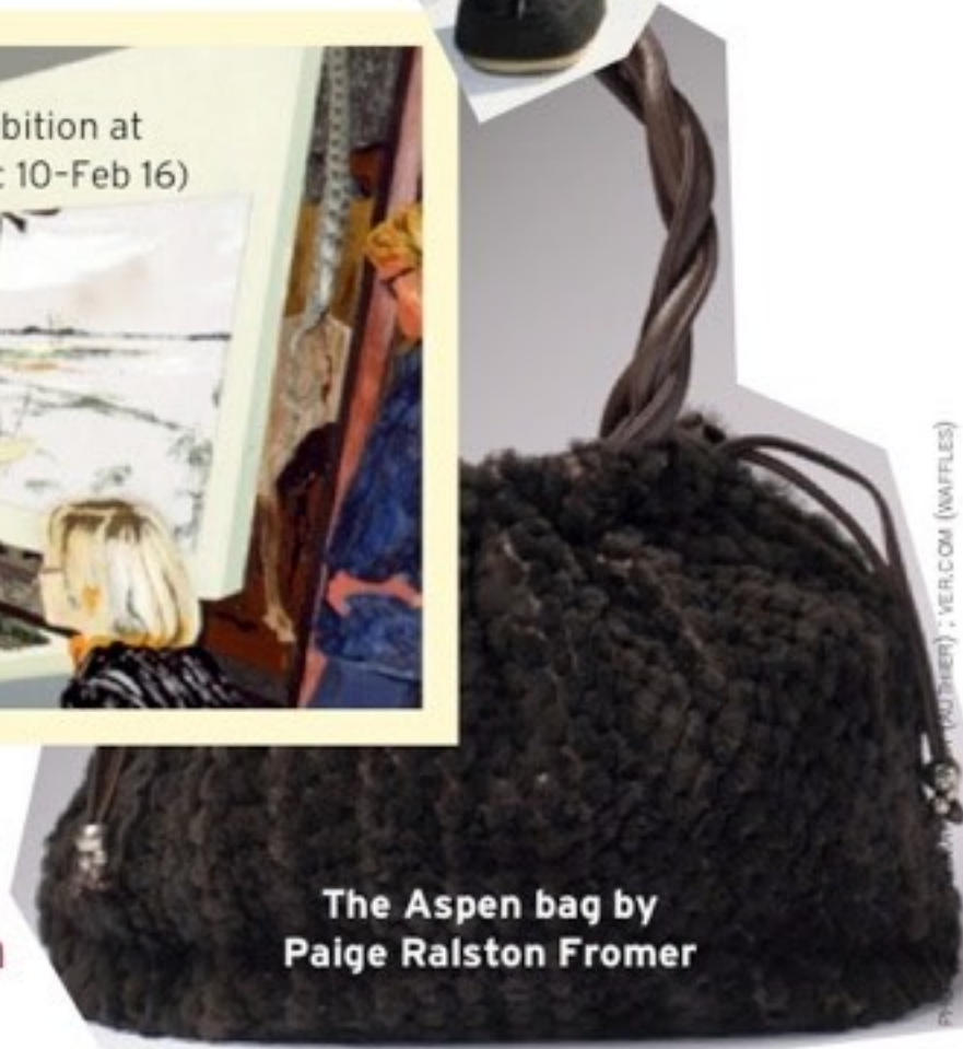
The Aspen bag by Paige Ralston Fromer