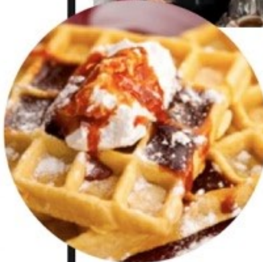
Sunday Blues Brunch at Jimmy's, an American Restaurant & Bar