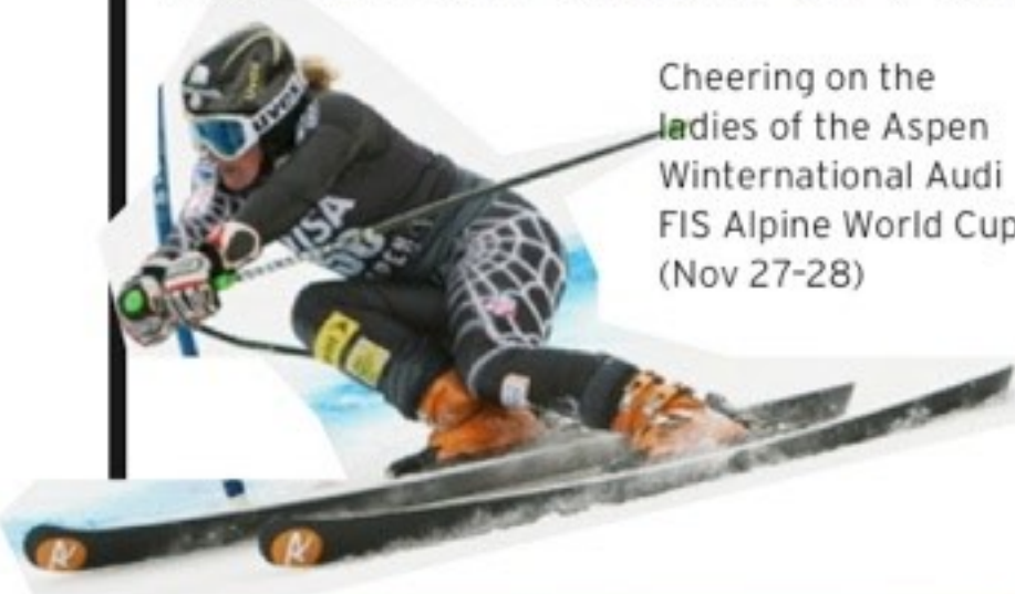
Cheering on the ladies of the Aspen Winternational Audi FIS Alpine World Cup (Nov 27-28)